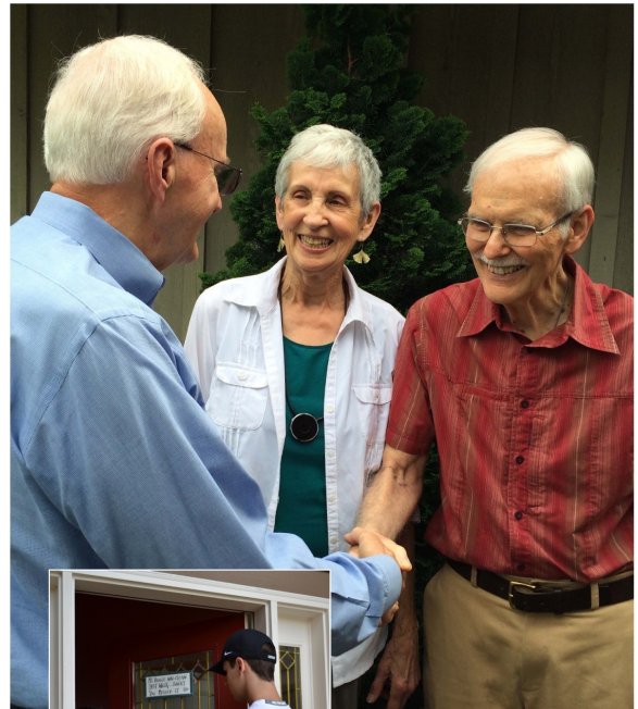
Neighbors helping neighbors stay neighbors