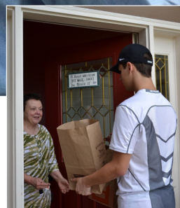
Neighbors helping neighbors stay neighbors